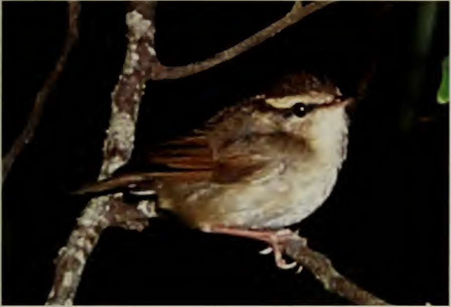
Plate 1. Photograph of Asian Stubtail Urosphena squameiceps captured at Sibaliw, Panay on 9 October 1999.